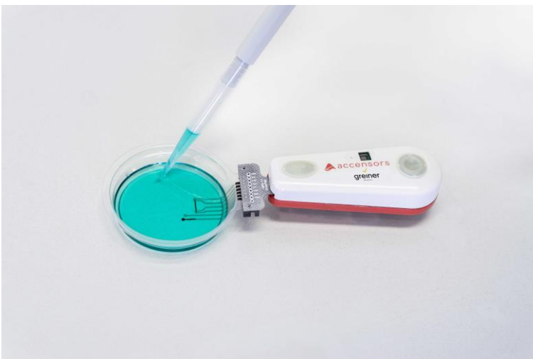
Caption: Using technology from Accensors, reading out the measurements from the intelligent petri dish is simple via either a scanner or an app.