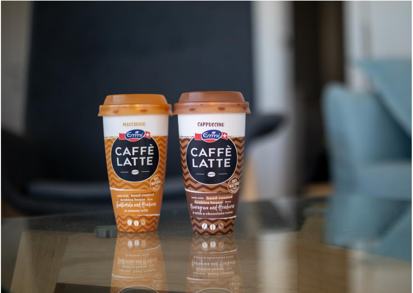
Caption: Focusing on recyclable packaging and the use of recycled materials, together with Borealis and Greiner Packaging, Emmi is taking their next big step with the Emmi CAFFÈ LATTE brand.